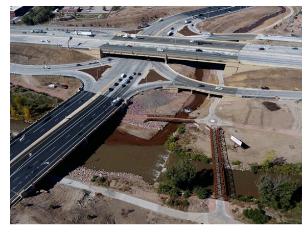
The new Cimarron interchange

heart of Colorado Springs) in 2007, a decade ago.