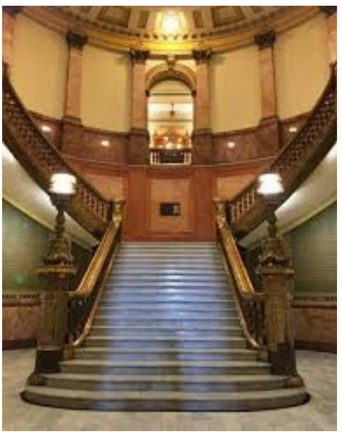
Staircase at Colorado State Capitol

<u>Funding</u>: Transportation funding will be first and foremost again this year. Already, there are plenty of conversations swirling about how to fund Colorado's roads and bridges. Many legislators are calling for dedicated general funds to be used annually for transportation bonds. Their argument is that no general fund money is dedicated directly to transportation projects and it should be a priority for the state budget. Other legislators advocate that there must be a voter-approved dedicated tax increase to pay for roads, as this is the only way to ensure a stable and secure funding source for state infrastructure needs.