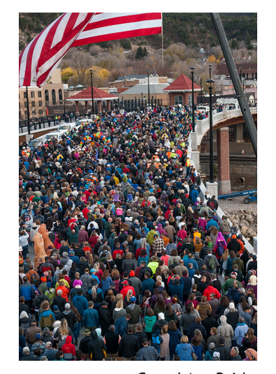
Grand Ave Bridge Ribbon Cutting

The Grand Avenue Bridge in Glenwood Springs is the largest infrastructure project on the Western Slope in 25 years and replaced a 64-year-old bridge over the interstate, the Colorado River, and Union Pacific Railroad tracks. A substantial detour that started in August and was completed 2 weeks ahead of schedule much to the relief of the local community, who turned up 3,000 strong for the ribbon cutting in early November. Funding for the bridge was accelerated due to FASTER funding. The $125 M bridge replacement project also provide several multi-modal improvements including the new and improved pedestrian bridge that connects the south downtown core to to the north historic hot springs district as well as a pedestrian tunnel that provides a safe route through the north side of town at the main Glenwood Springs exit from the I-70 interchange.